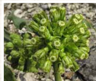
Green-flowered Milkweed ( Asclepias viridiflora )