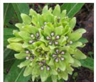
Green Milkweed ( Asclepias viridis )