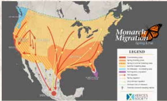
Monarchs feed and breed in Georgia on both the north-bound spring migration of the eastern population as well as the return trip to Mexico in the fall.

What's happened? There are many suspects, including loss of host plants, destruction of habitat, climate change, and increased pesticide use. While any one of these factors could be problematic, taken together they may spell doom for Monarchs. These butterflies are the proverbial “canary in the mine.” Their troubles are our troubles, warning of danger to the health and well-being of humans as well as plants and other animals.