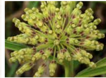
Barrens Milkweed ( Asclepias hirtella )

Six milkweed species are rare in Georgia (found in 11 or fewer counties) or listed as Special Concern by the Georgia Department of Natural Resources. Plant scientists and conservationists are working on securing these species and restoring their habitats on protected lands. Until we know more about these species and their status in Georgia, it's probably best to leave their cultivation to the experts. If you come across one of these rare milkweeds in the woods, let Georgia DNR know by calling 706-557-3032, but please, do not buy, collect, or plant these milkweeds!