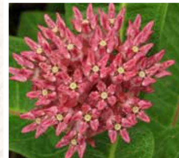
Purple Milkweed ( Asclepias purpurascens )