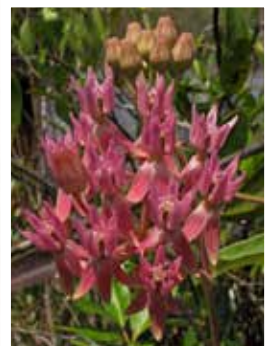
Red Milkweed ( Asclepias rubra )