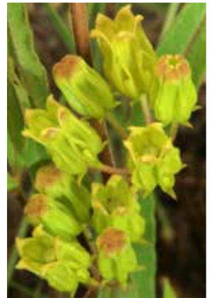
Savanna Milkweed ( Asclepias pedicellata )