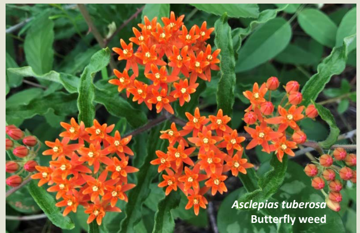
Asclepias tuberosa Butterfly weed